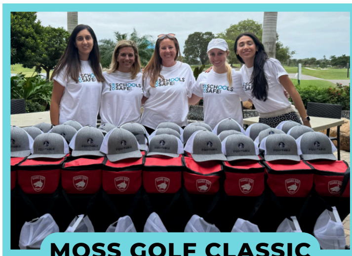
MOSS GOLF CLASSIC