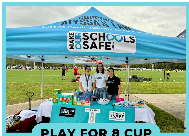
PLAY FOR 8 CUP

Make Our Schools Safe (MOSS) hosts and participates in multiple fundraising events throughout the year. Volunteer involvement is essential for the success of these events, which raise funds to support initiatives that improve school safety and protect students and staff. Whether through planning, organizing, or assisting during events, every volunteer plays a critical role in helping MOSS achieve its goals.